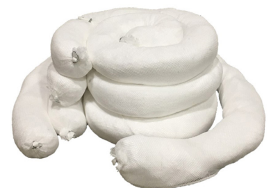
DVOMB5X10 DVOMB5X20 DVOMB8X10 DVOMB8X20